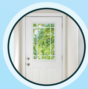
Insulated Exterior Doors