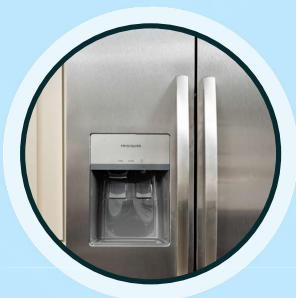
ENERGY STAR® Frigidaire® Appliances