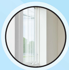
Lux® Argon Gas Low-E Windows