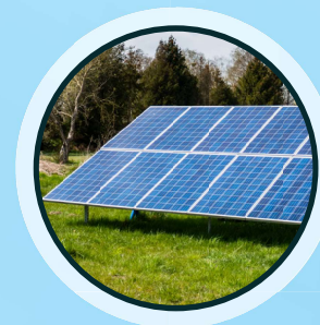
Solar - Ready