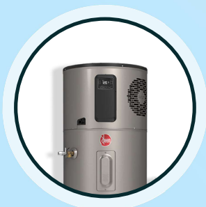
Rheem® Hybrid Heat Pump Water Heater