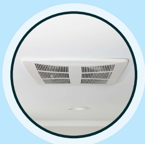
Whole House Ventilation System