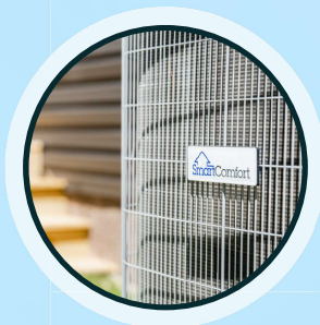
SmartComfort® by Carrier® HVAC Heat Pump or Gas Furnace