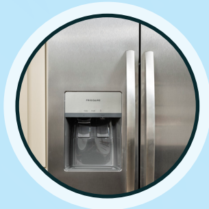
ENERGY STAR® Frigidaire® Appliances