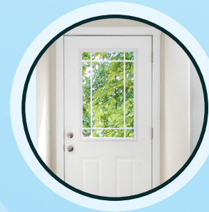
Insulated Exterior Doors