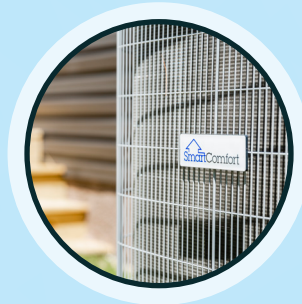
SmartComfort® by Carrier® HVAC Heat Pump or Gas Furnace