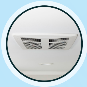
Whole House Ventilation System