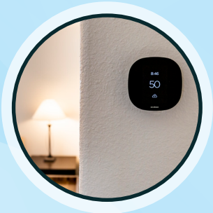
ecobee® Smart Thermostat