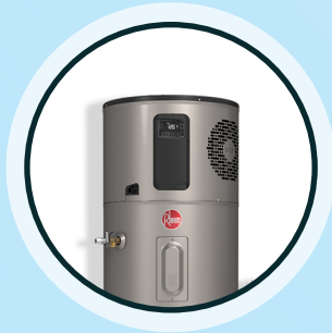
Rheem® Hybrid Heat Pump Water Heater